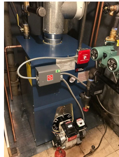
The new Utica BC Oil Fired Hot Water Boiler installation features all new controls, pipings, and pumps.

"I believe the men and women that have fought for our freedom is one of the most important things we can do. Without them, we would not have anything. Giving back to them is the least we can do."